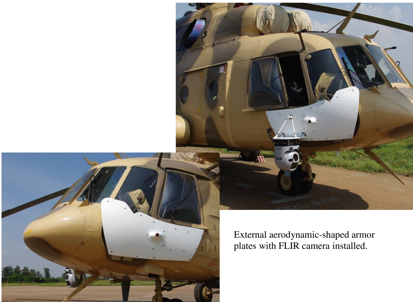
External aerodynamic-shaped armor plates with FLIR camera installed.